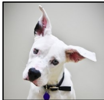
Airplane ears - Mixed Emotion