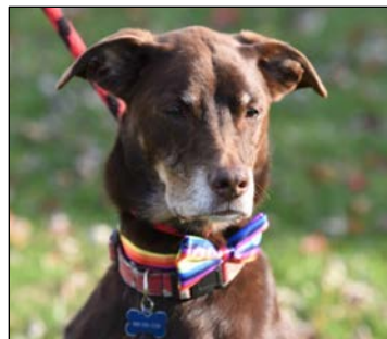
Ears back - Submissive or Cautious