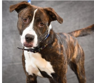
Neutral tail, relaxed wag - neutral height straight at attention, is alert and attentive