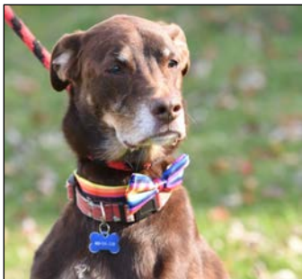
Flat back - Fearful or Defensive