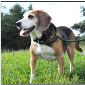
Open mouth - relaxed or playful

An air snap is a warning. If a dog bites the air near you this is a sign that they mean business. They did not bite you because they don't want to, but you have been warned that they will bite if needed. Heed this warning and give the dog space.