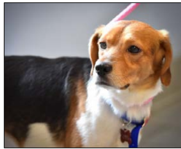
Closed mouth - tension (also seen in face)