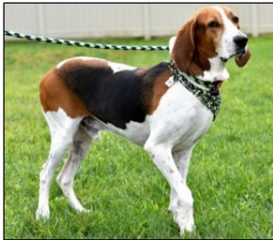
Low, tucked tail - Stress, fearfulness