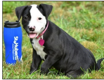
Neutral tail, still - relaxed