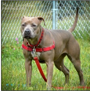
High tail, quick tight wag - Aroused

The height of the tail as well as the speed of its wag has meaning. Some breeds (malamutes, pugs) have a high carriage of their tail. For these types of breed the tail will not be your strongest indicator of the dog's mood. Note: this section is best explained by demonstration, not still images.