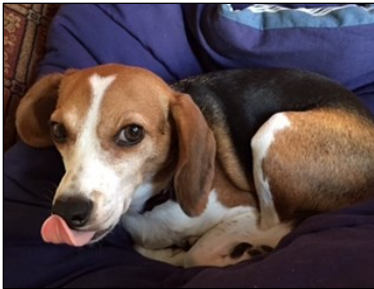
Tongue flicks, lip lick - Signs of stress